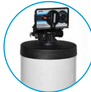
10x54 platinum jacket Fleck 5600