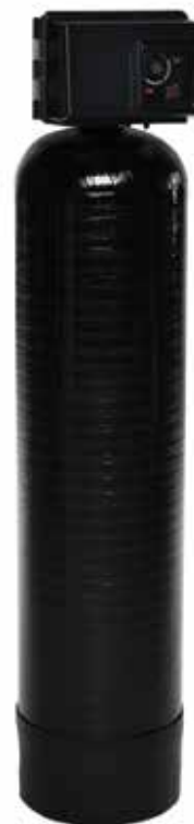
13x54 black tank Fleck 2750