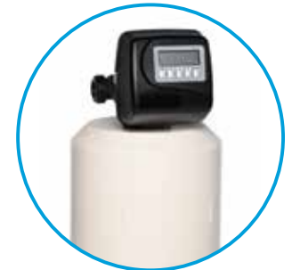
10x54 almond jacket Clack WS1