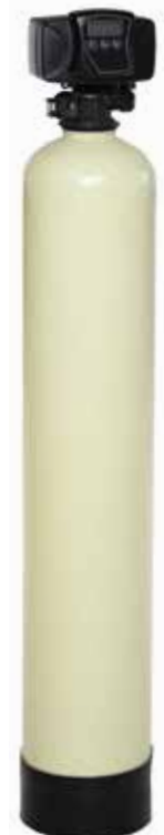
9x48 almond tank Fleck 5600 sxt